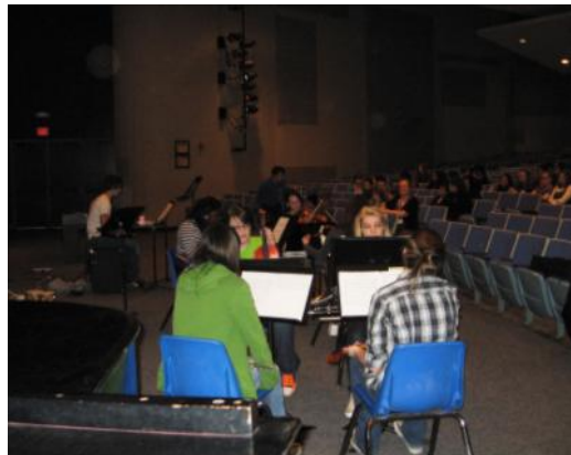
Left: MHS student ensembles warm up for the 'Olympics' in the school auditorium.