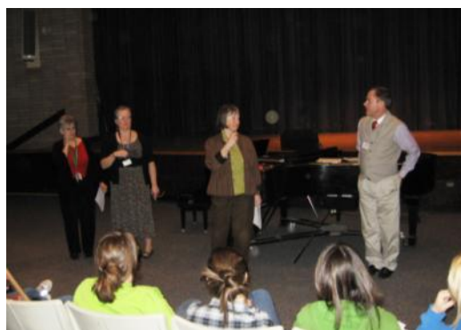
An inspired experiment in getting kids to experience the success of practice came to fruition Feb. 18 when 10 MHS